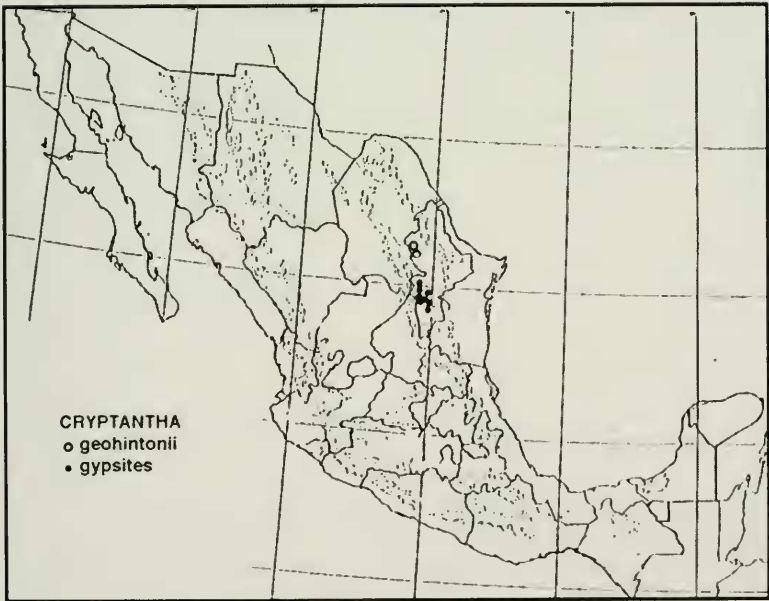
Fig. 2. Distribution of Cryptantha gypsites and C. geohintonii .